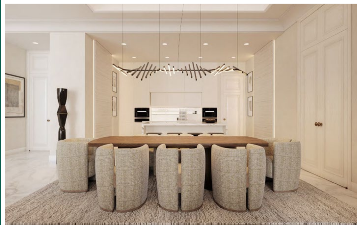
Show Unit #11A Designs by Humans for Vinoti