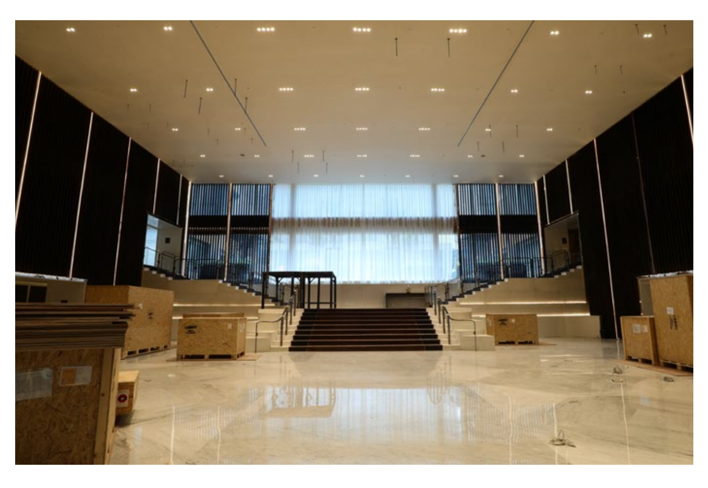
Great Hall Lobby . Lasvit chandelier will be installed on September, furniture already on site. Tea lounge and receptionist will occupy the hall.