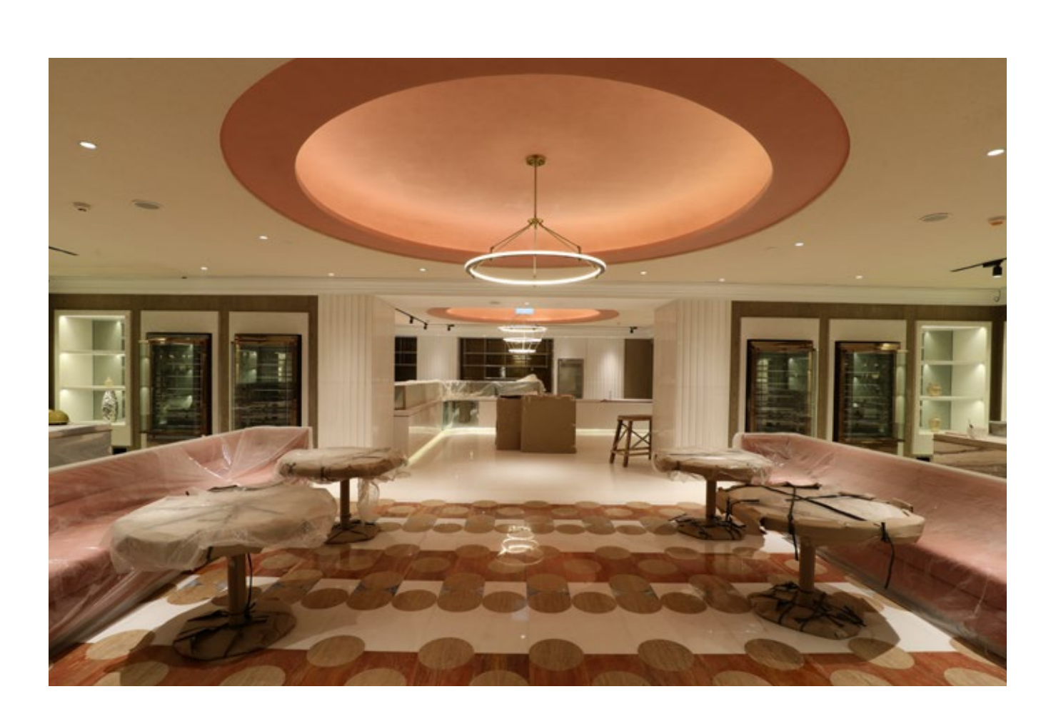
Rose Gourman Deli is progressing smoothly and is 85% done. Currently is still finishing defect process.