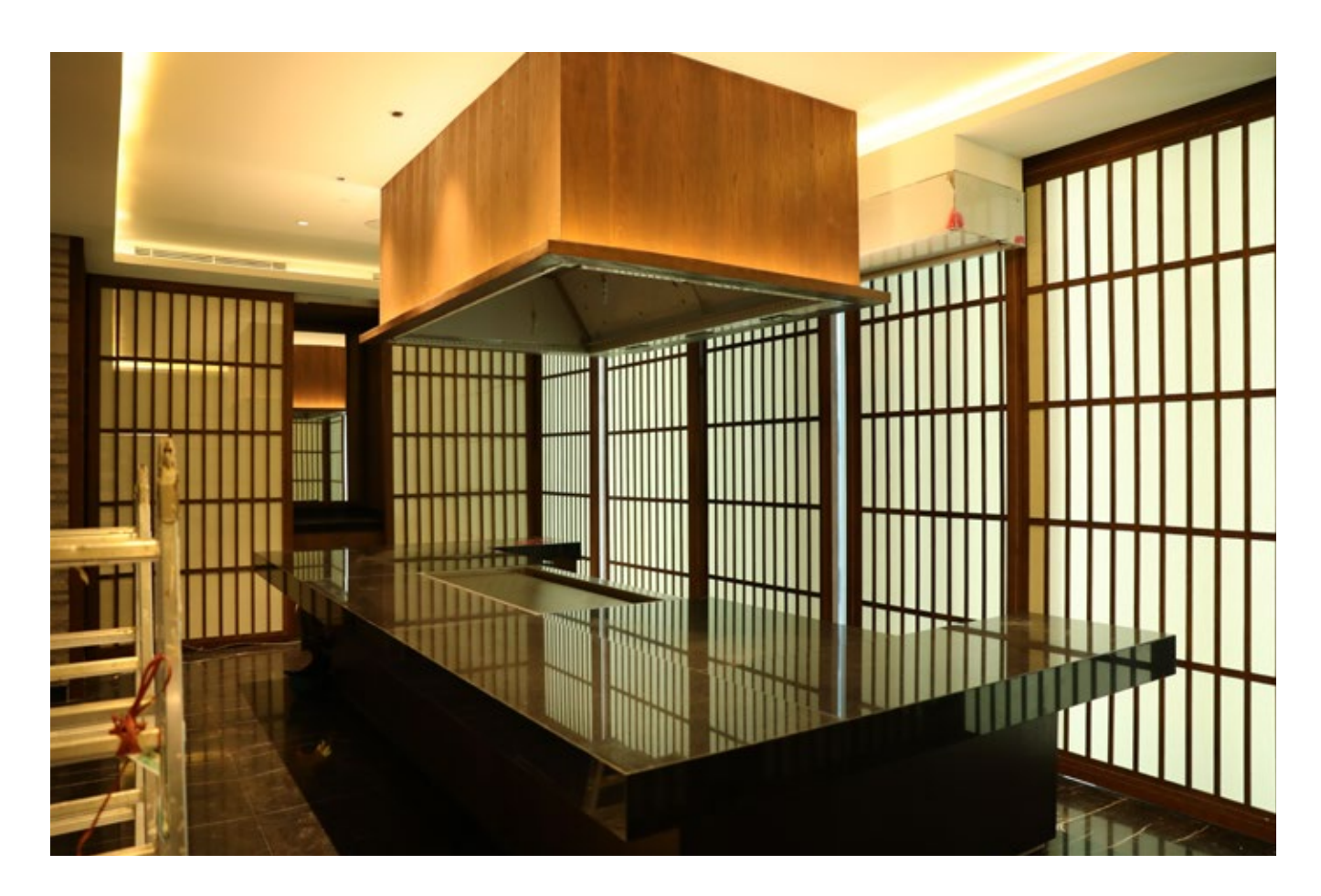
Teppanyaki Dining Room will test exhaust system on mid August. Furniture will be installed on end of August.

The interior progress of the luxury apartment, The Residences at The St. Regis Jakarta at Jl. H.R. Rasuna Said is as follows: