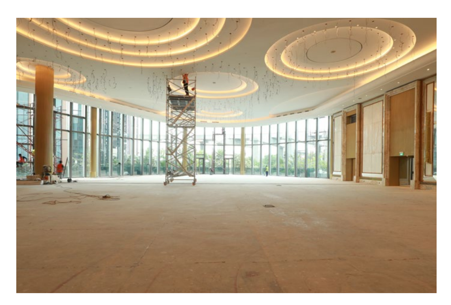
Astor's Ballroom chandelier and carpet installation wil be at the end of August.