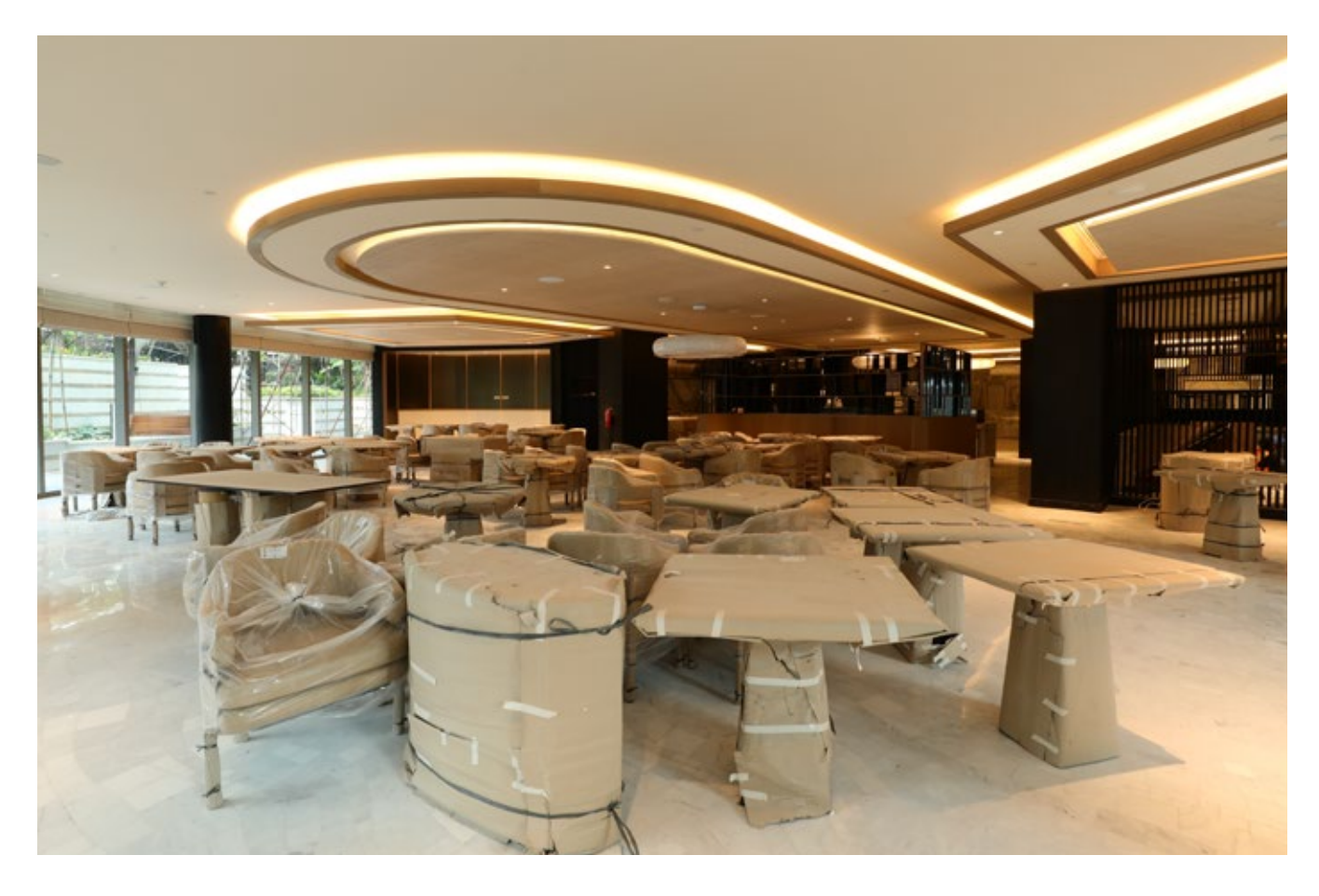
All-Day Dining . F&B counter installation is at 80%, furniture will be installed at end of August. Capacity for 220 pax.