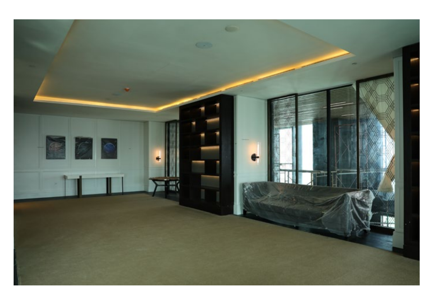
Library is 95% finished. Carpet will be installed on end of August.