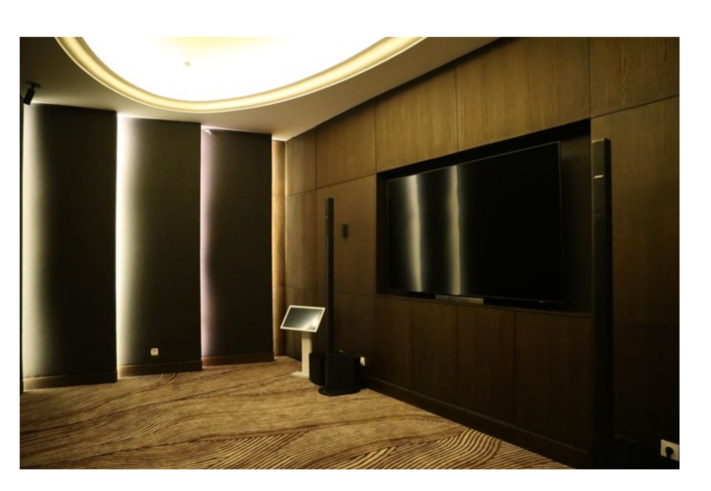
Home Theatre . All bluetooth and audio system is tested and done. Furniture will be installed on end of August.