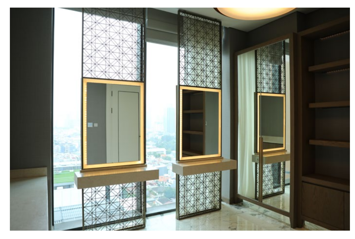
Salon Studio . Built-in millwork and interior is finished. 1 room for hair salon and another for nail that holds 2 pax each room.