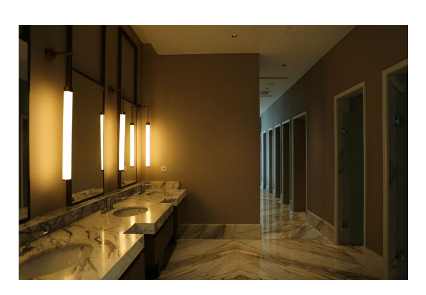
Changing Room. Steam and sauna will be finished in end of August. Finishing works is currently at 80%.