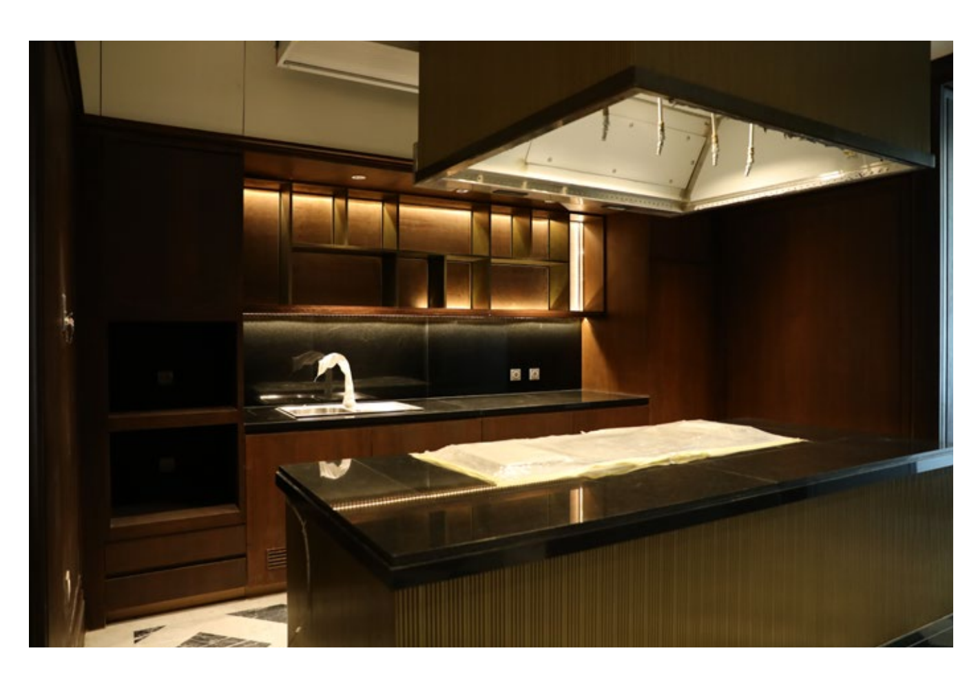
Western Dining Room is progressing smoothly and is almost done.